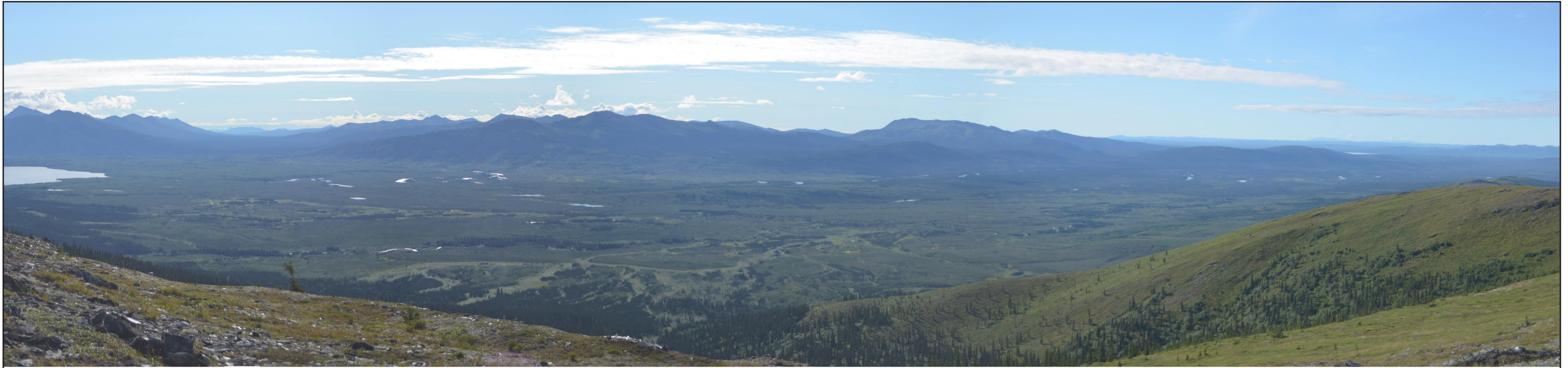
KOP 3 - ROW West High Existing - Looking Southeast (North Route)