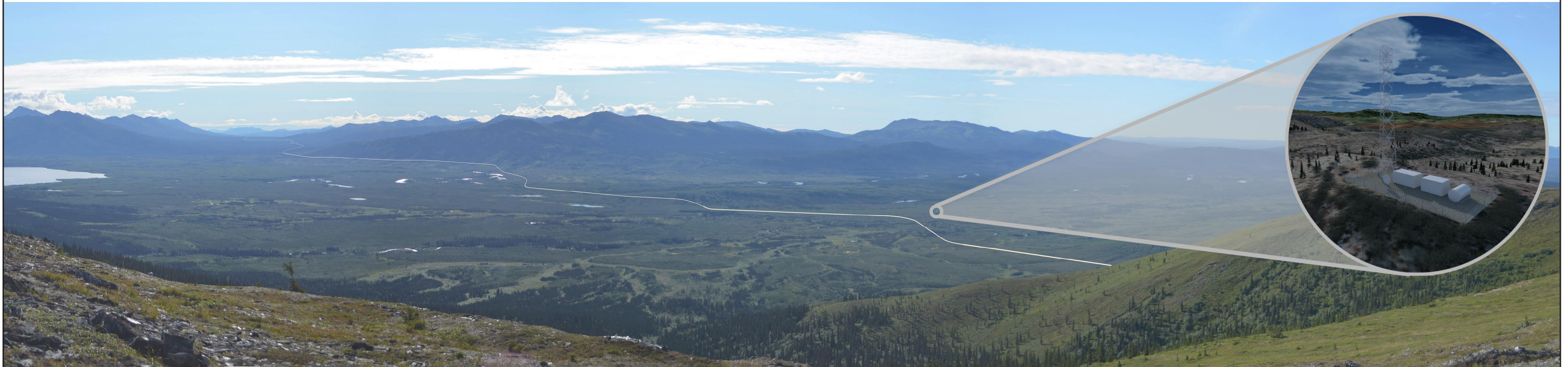
KOP 3 - ROW West High After Construction- Looking Southeast (North Route)